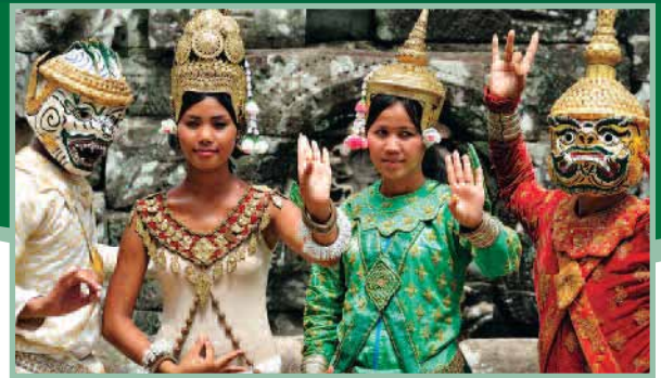
Apsara dancers in Cambodia